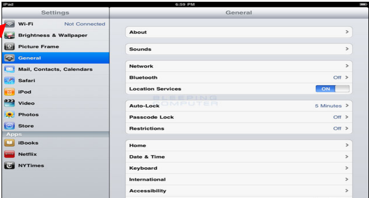
General Settings screen